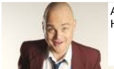
Al Murray studied History at Oxford.